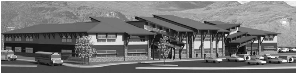
The Grand Coulee School District was granted $32 million to go forward with a new K-12 facility. The new school is being built on the same site as a formerly mothballed elementary school that has since been demolished.

After years in court with the federal government, the tribe was eventually compensated with a lump settlement of approximately $53 million, plus annual payments of approximately $15 million. A modest piece of the pie compared to the amount of power and money generated yearly from the dam.