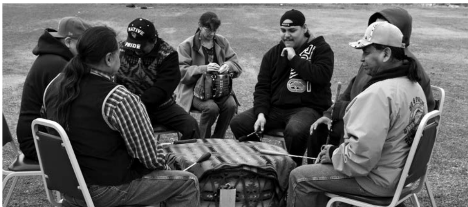
At the formal groundbreaking ceremony, members of the Colville Indian Reservation performed in a drum circle tribute to the new school.