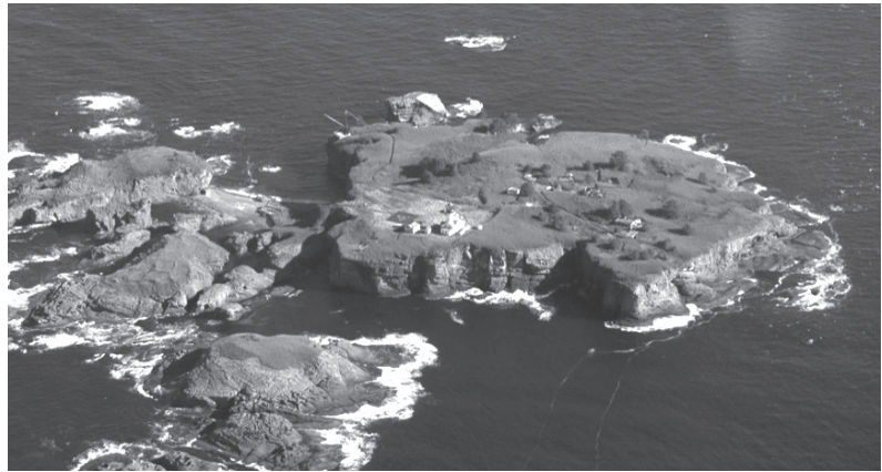
Tatoosh Island is the largest of a small group of islands just offshore of Cape Flattery. Access to the island requires written permission of the Makah Tribe.