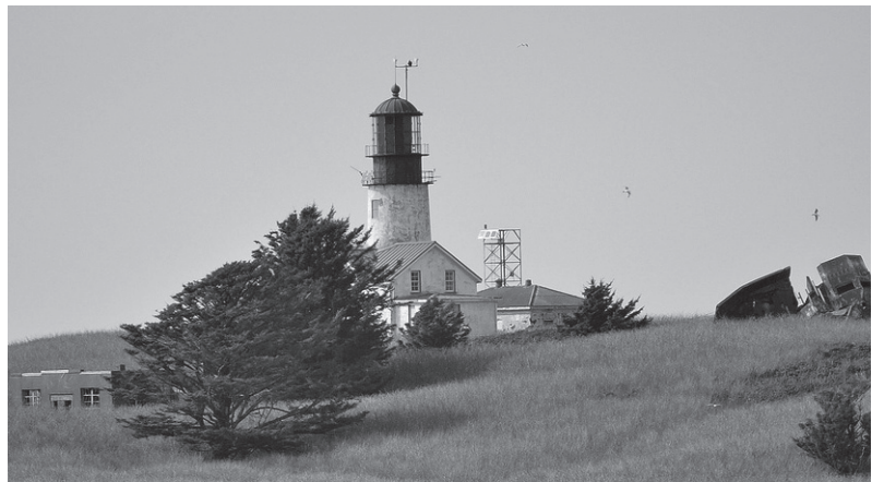
The Cape Flattery lighthouse, built in 1854 and automated in 1977, is owned by the US Coast Guard.

The two-minute video can be seen at www.samsung.com/solvefortomorrow .