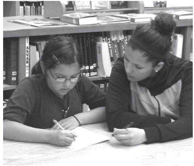
Left: Students in the Catalyst Corps/Mentor Buddy program steer a research vessel during a field trip in the Strait of Juan de Fuca. The field trip was made possible by an award from the Washington STEM program. Right: Mentor/buddy pairs partner for tutoring sessions three times a week.

natural intelligence — is the key to success in school and in life. Staff and students soon embraced this growth mindset philosophy with measurably improved results.