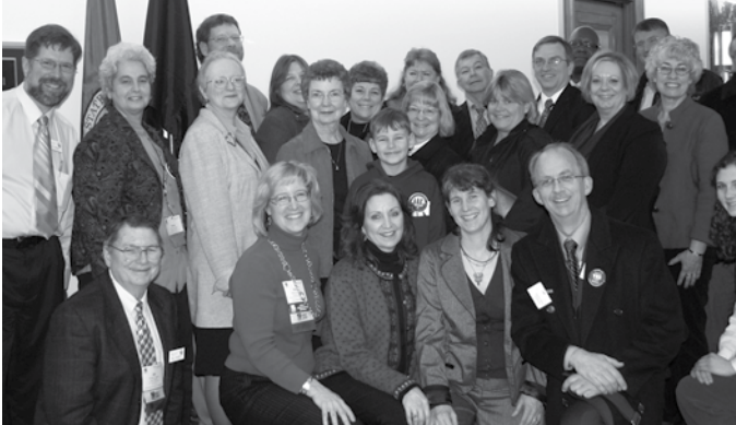
Members of the WSSDA FRN delegation following a meeting with Sen. Maria Cantwell.

Two dozen school directors from Washington state joined more than 800 colleagues from around the country last month to ask Congress to make K-12 education a top priority in the current session.