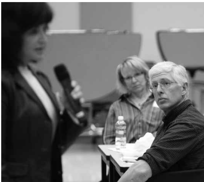
Attendees hear a presentation at WSSDA's Spring 2010 Regional Meeting in Cashmere

The schedule for WSSDA's fall Regional Meetings has been set. These meetings are small, close-to-home gatherings—your opportunity to dialogue, network and share information with school directors from around your region, and hear presentations on current issues from education leaders.