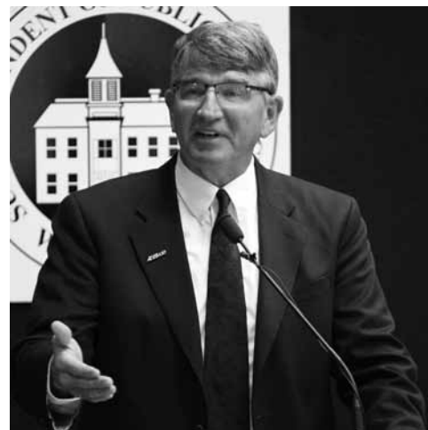
State Superintendent Randy Dorn presents the preliminary HSPE score results at a press conference in Olympia

Additional information regarding the HSPE score release and graduation requirements is available on the OSPI Web site at www.k12.wa.us/Communications/PressReleases2010/HSPERelease.aspx