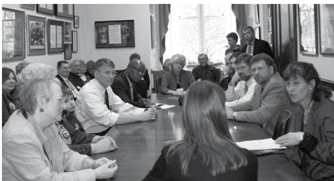
Members of the 2010 FRN delegation during a meeting on Capitol Hill last February.

WSSDA is seeking members for its Federal Relations Network, a component of a nationwide network of school directors under the auspices of the National School Boards Association. Washington state currently has 44 FRN members, who maintain