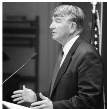
Dorn presents MSP and HSPE results at a late August news conference. Full results are found at www.k12.wa.us/ .

The 10th-grade HSPE saw slight decreases in math, reading and writing. Science, which becomes a graduation requirement for incoming 10th graders, saw an increase.