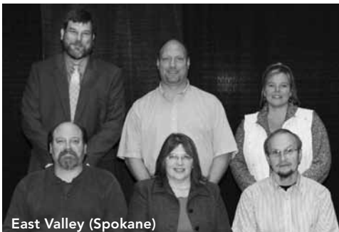
East Valley (Spokane)