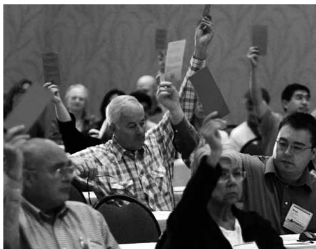
WSSDA Legislative Representatives cast a vote during September's Legislative Assembly

The LEA program, also known as levy equalization, provides supplemental funding to school districts that cannot raise as much revenue from special property tax levies because of lower property values. Cuts to LEA would hurt the 216 districts that currently receive levy equalization