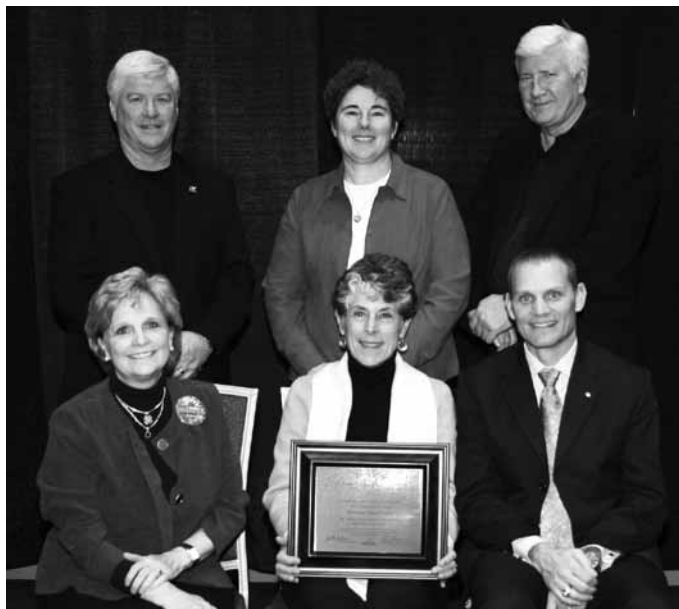
Vancouver school directors

The Board of Directors of the Vancouver School District has been selected as WSSDA's 2010 School Board of the Year. The announcement was made last month at the WSSDA Annual Conference in Spokane.