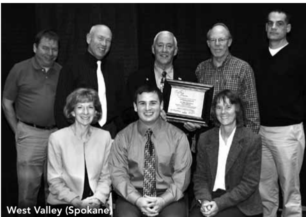
West Valley (Spokane)