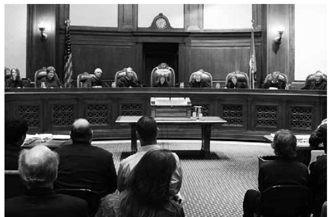
Washington's nine Supreme Court Justices await arguments in McCleary v. the State of Washington . The case was heard June 28 at the Temple of Justice in Olympia.